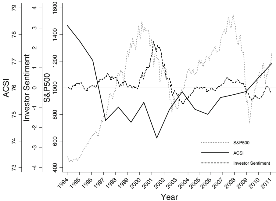
Fig. 1 S&P 500, ACSI, and investor sentiment from January 1994 to December 2010. This figure plots the S&P 500 index against the ACSI and Baker and Wurgler's (2006) investor sentiment index

and Wurgler 2004), the closed-end fund discount (Lee et al. 1991), and the equity share in new issues (Baker and Wurgler 2000). We explain each of these sentiment proxies in detail next.